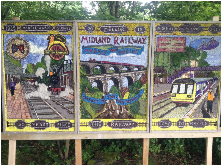
Mellor's beautiful well-dressing

Serving the communities of Mellor, Marple Bridge, Moor End, Mill Brow, Cote Green and Ludworth.